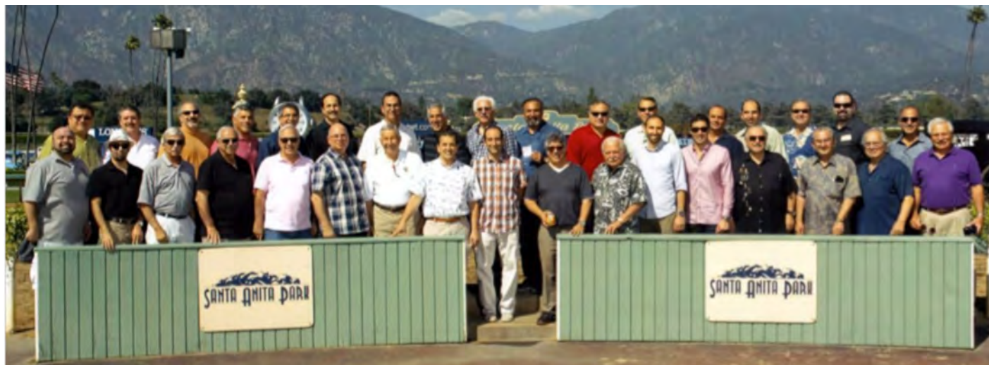
LA, OC and Sequoia Brothers at Santa Anita Day at the Races!