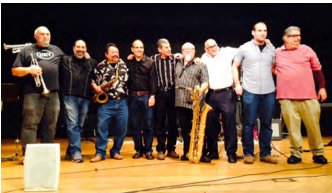
Trex's Brotherly Love