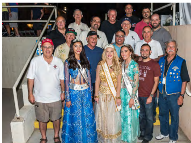
PALM DESERT BROTHERS @ THE DATE FESTIVAL. Palm Desert & LA Brothers with the Date Festival Queen & Princesses