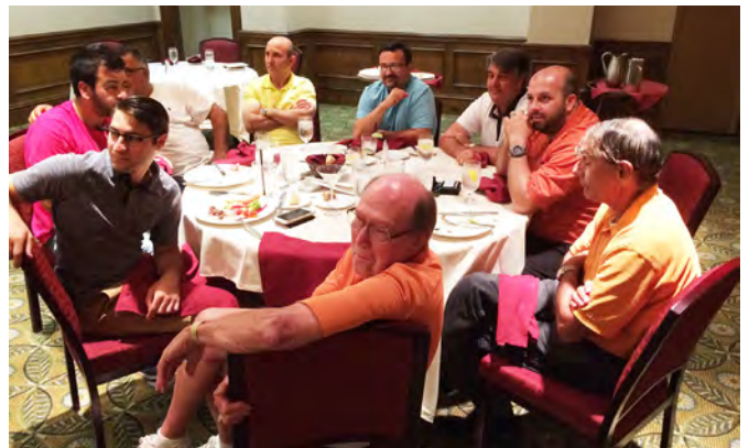
PALM DESERT PROSPECTIVE MEMBER NIGHT 2016. Palm Desert Members with some Prospective Members

In June we held a Prospective New Members night, where several young Armenian men enjoyed the evening with Palm Desert members and showed interest in joining