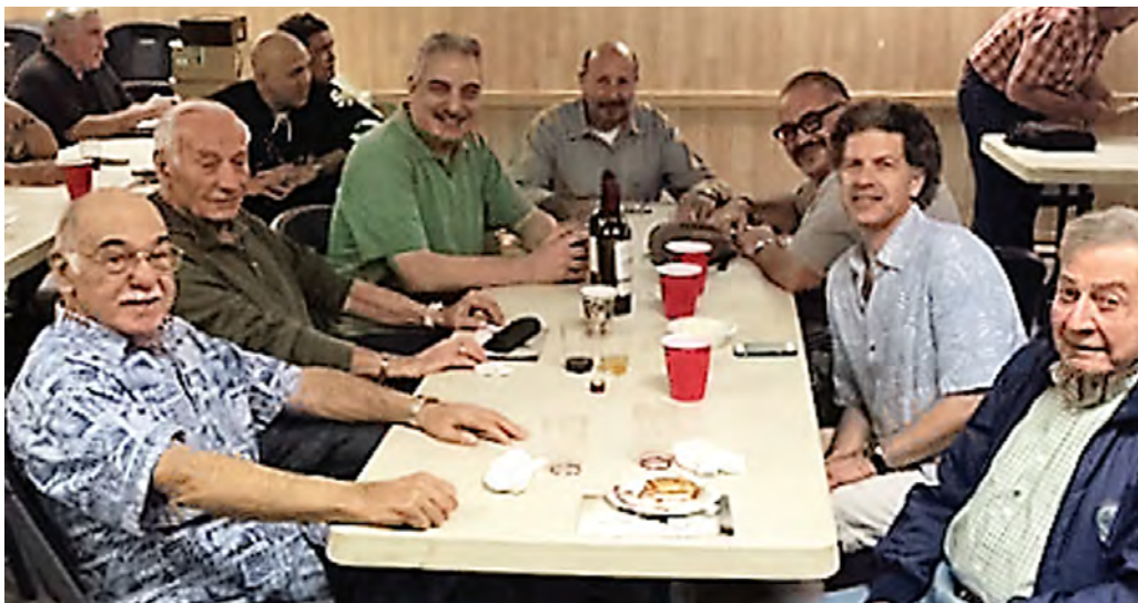
Mt Diablo Brothers at Oakland Joint Meeting