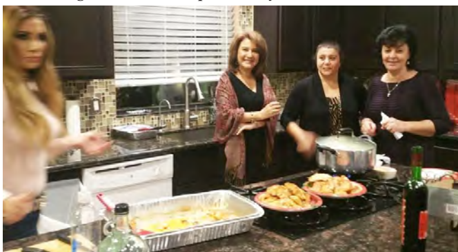
The Extra-Special XMAS Party Ladies that we don't take for "Granite" !