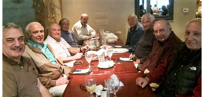
Mt Diablo Trex Dinner Meeting