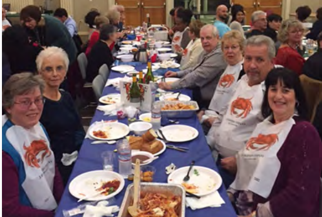
Guests at Crab Feed