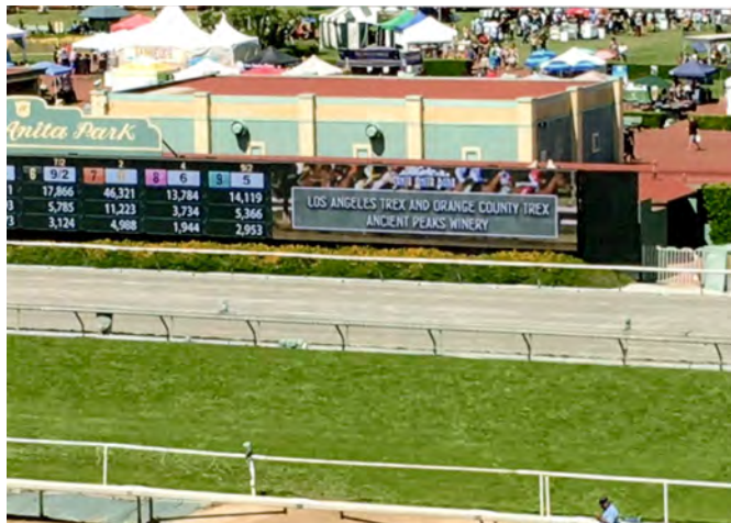
Day at the races Santa Anita Park LA and OC Trex Race.