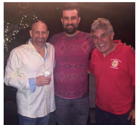
Oakland Bros at Cigar Night