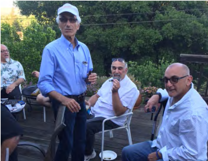
Trex Bros. At Cigar Night