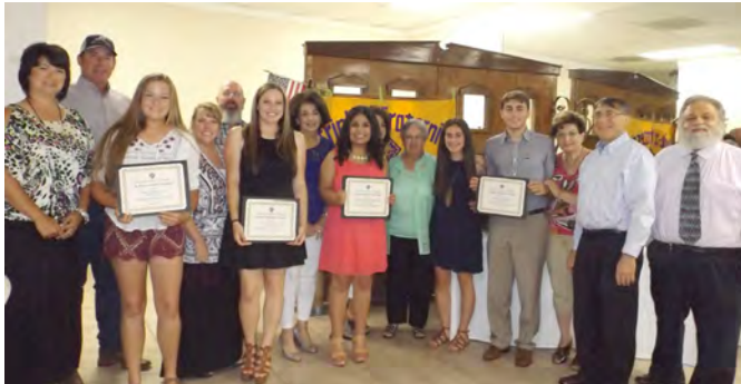
2016 recipients and their families.