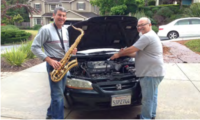
Trex - Brother Helping Brother