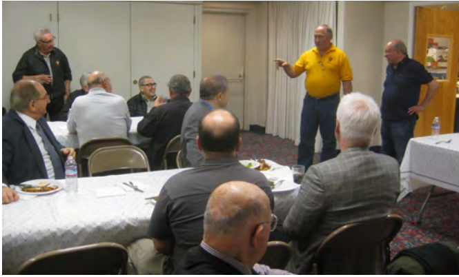
Post-meal pep talk, stand-up comedy, or perhaps even a meeting???