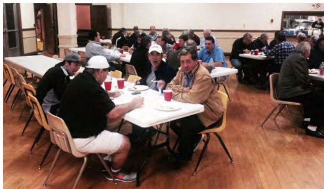
Sequoia Lamb Feed