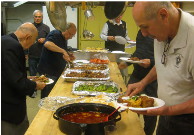
Brothers at the February joint Peninsula/Golden Gate dinner meeting load up their plates with delicious food