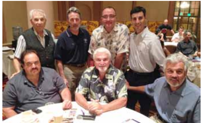
San Diego Trex Delegates 2015 Convention