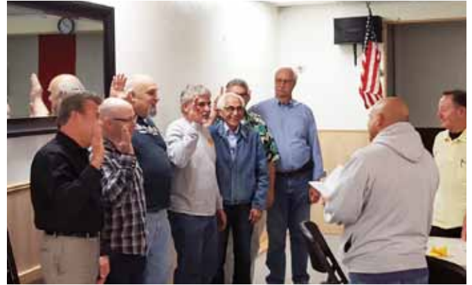
Swearing in Oakland Executive Board