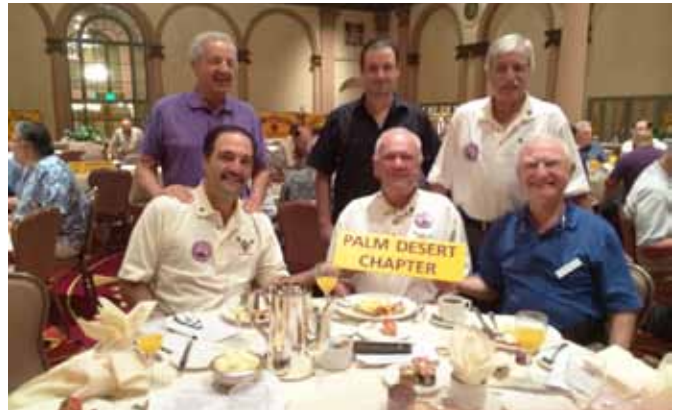
PALM DESERT TRIPLE-X CHAPTER at the Los Angeles Convention