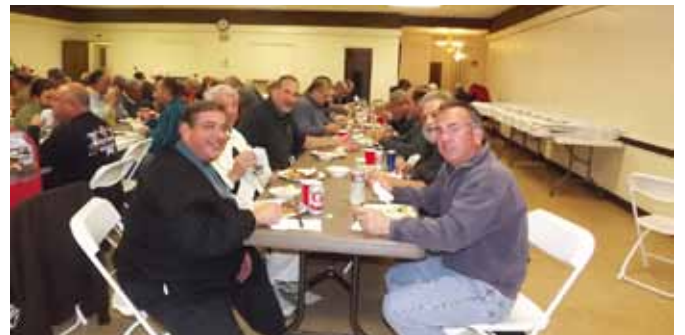
Joint Fresno-Selma Dinner/Meeting