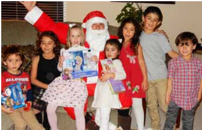
Santa Visits Trex Kids 2015