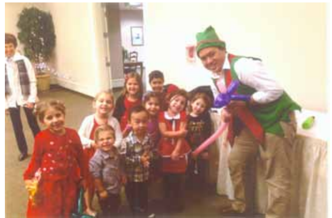
Christmas Party with the Magician