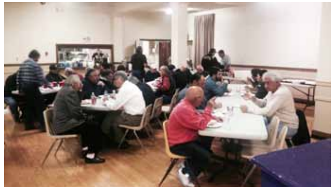
Sequoia Lamb Feed