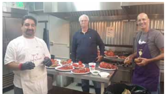
Trex Chef's at Lobster Feed