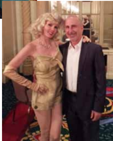
Even Editors Get Lucky!