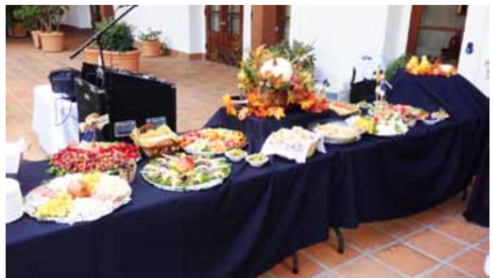
San Diego Trex 2015 Wine & Cheese Mezza