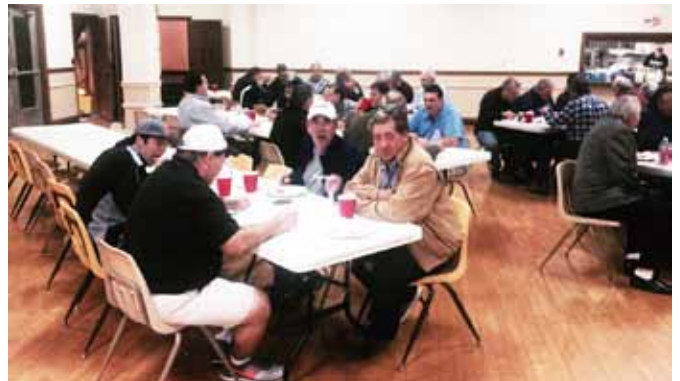
Sequoia Lamb Feed