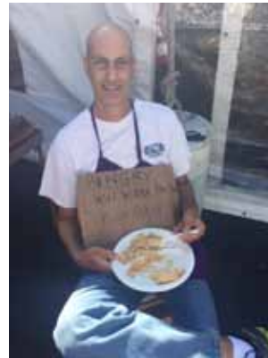
A Brother who has fallen on Hard Times

Since our last news article, the Oakland Chapter has had