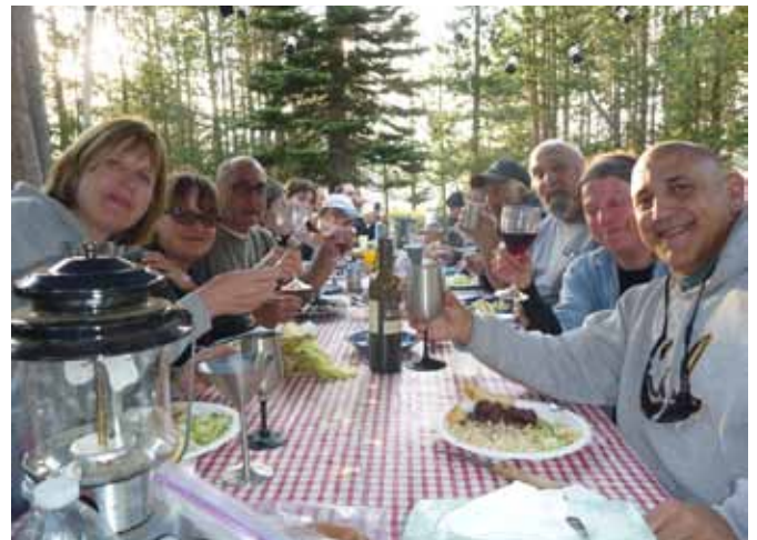
Trexmen At Loon Lake