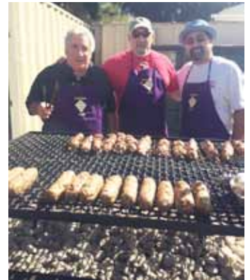
Bro's Cooking at Church Bazaar