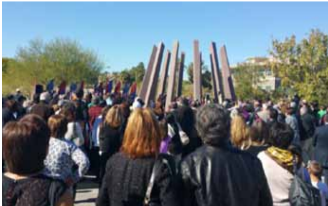
Standing room only at the Consecration of the Genocide Monument