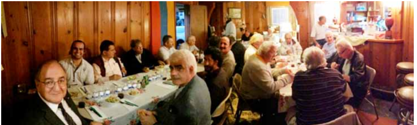
TREX meeting at Auntie Lou's Clubhouse.