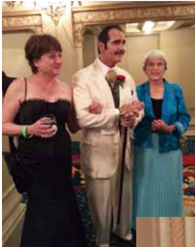
What...is that Rhett?