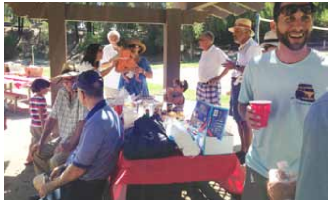
San Diego Trex 2015 Summer Picnic