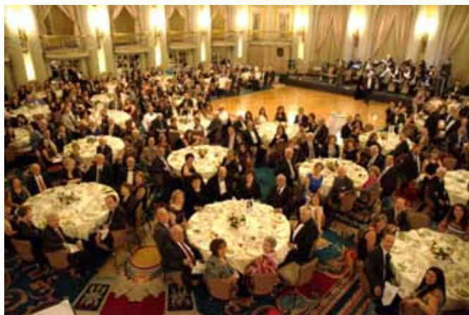
Saturday night's Dress to the Nines Sold-Out Dinner Dance in the Crystal Ballroom of the Biltmore. This picture is a recreating of the 1923 Opening Night Gala photo at the Biltmore.