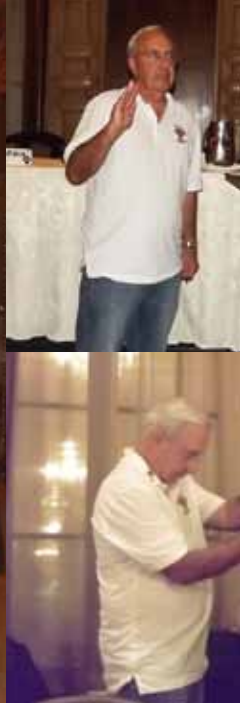
2015 Convention in Los Angeles