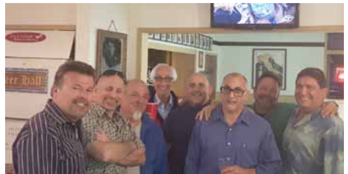
Oakland Bros at Meeting