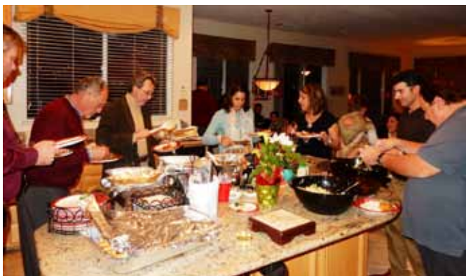
Trex 2015 Christmas Party