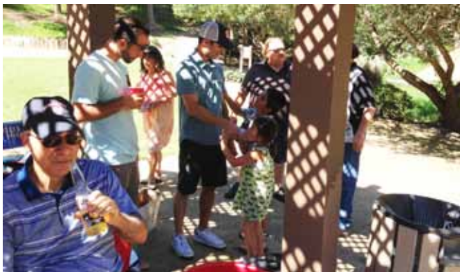
San Diego Trex Summer Picnic 2015