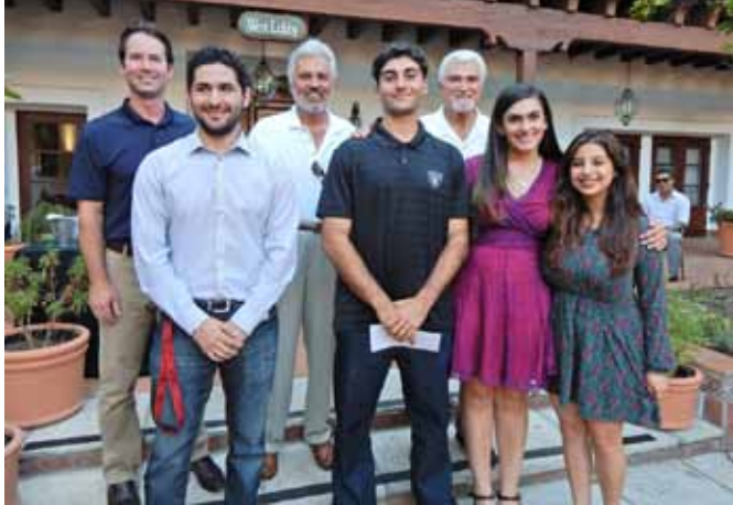
2015 Scholarship Award Winners