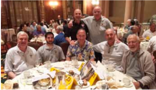
GGC Delegates at the Men's Breakfast Sunday Morning