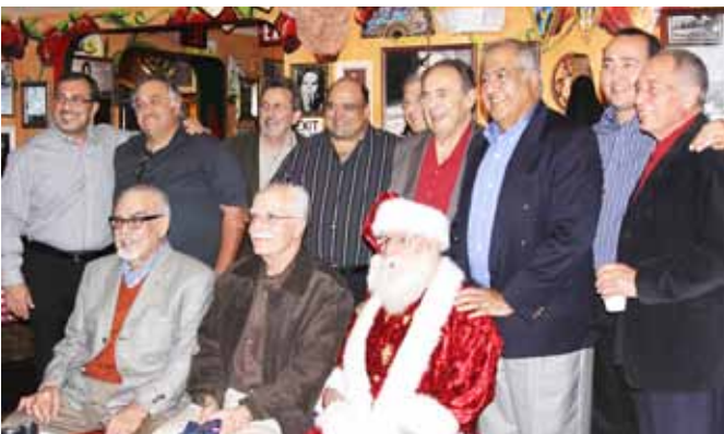
Trex Christmas Party 2012, Trexmen