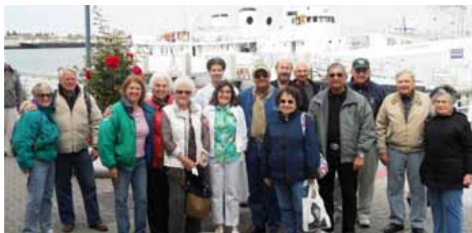
Mt Diablo USS Potomac