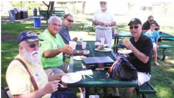
San Diego Trex Picnic-Trex Brothers