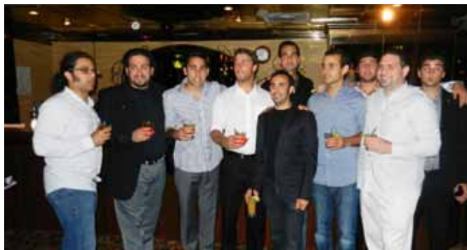
The Juniors on the Convention Cruise