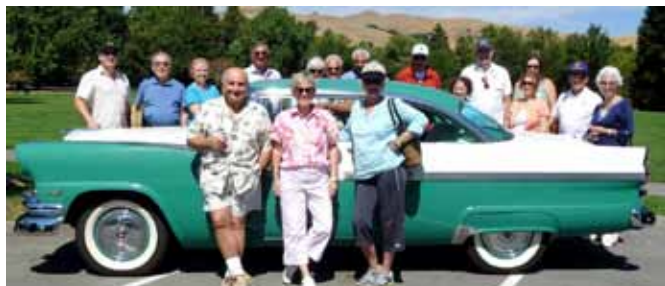
Mt Diablo Trex Picnic, Kevork's Toy.