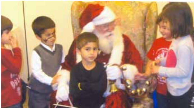
Christmas Party - Kids having fun