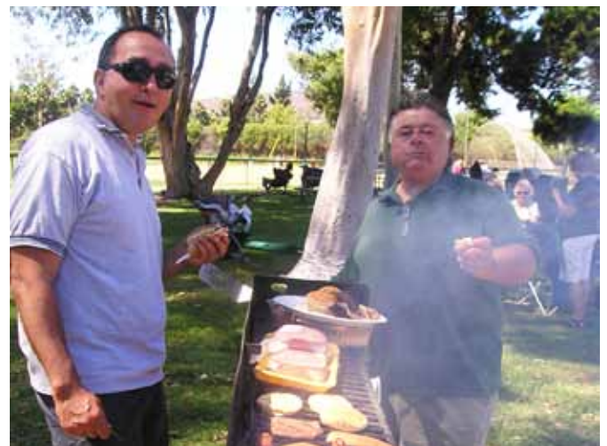
San Diego Trex Picnic-Cooks