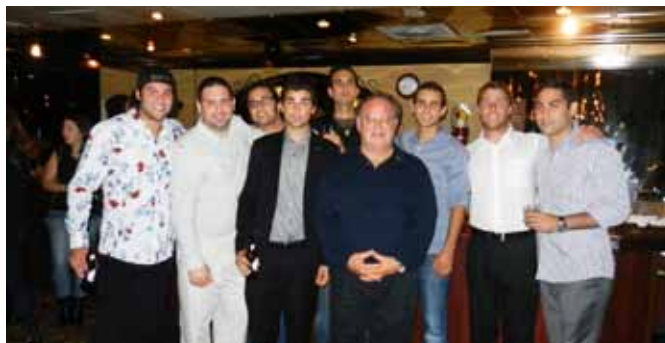
The Juniors on the Convention Cruise