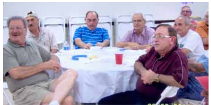
Meeting at the Club House