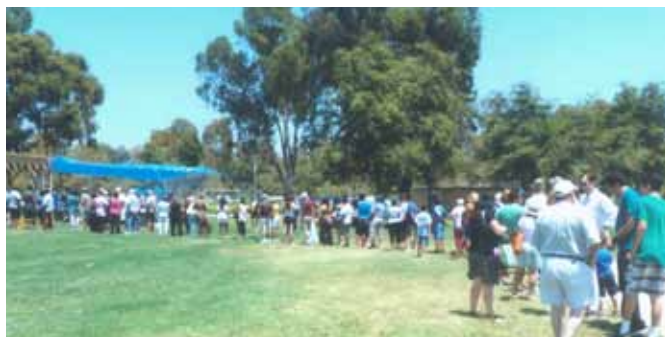
Trex Picnic - Line for delicious Shish Kabob Dinner