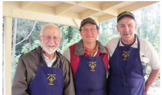
"Slinging kebabs at the St. John's Church Bazaar"