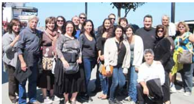
Brothers and wives from Los Angeles and Palm Desert Chapters enjoying Fisherman's Wharf at the San Francisco XXX Convention.