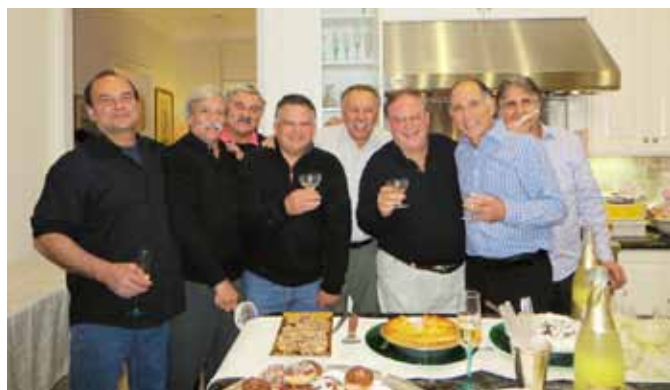
New Years Eve 2012, Triple X Brothers, with family and friends.