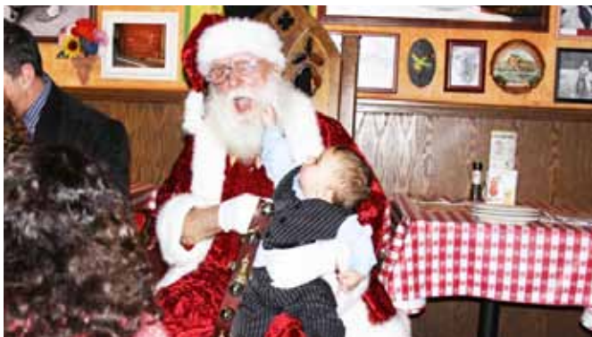
Trex Christmas Party & Santa