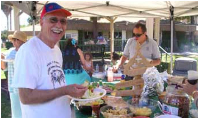
San Diego Trex Picnic-Good Food