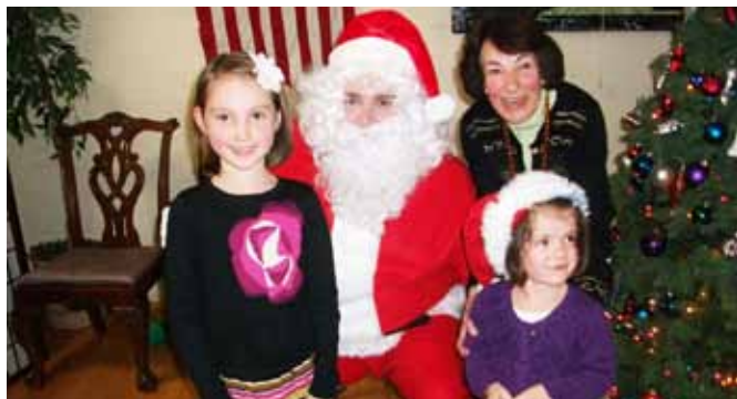
Santa was generous and the kids were happy.