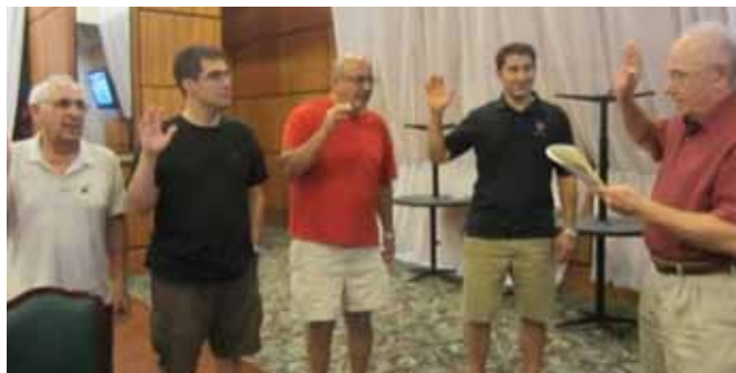
Installation of the newly elected Executive Board.

Soon afterwards, brothers and their families attended the 2011 Las Vegas Convention hosted by the Las Vegas Chapter during Labor Day Weekend. All of us that attended truly had a wonderful experience throughout the entire weekend. Thank you to