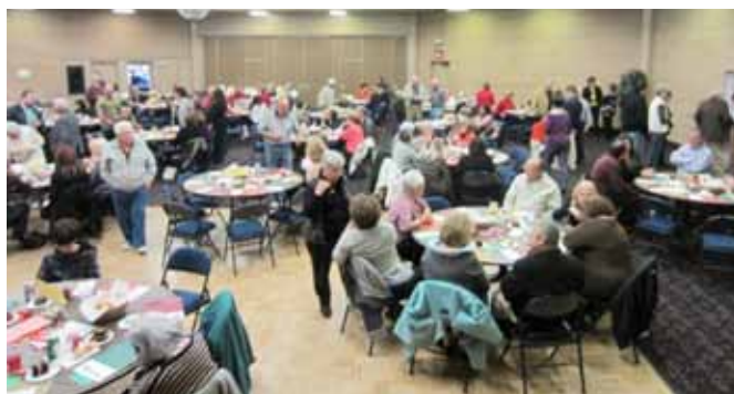
Attendance at Turkey Bingo on November 19th, 2011 inside St. Paul Armenian Church – Fresno.