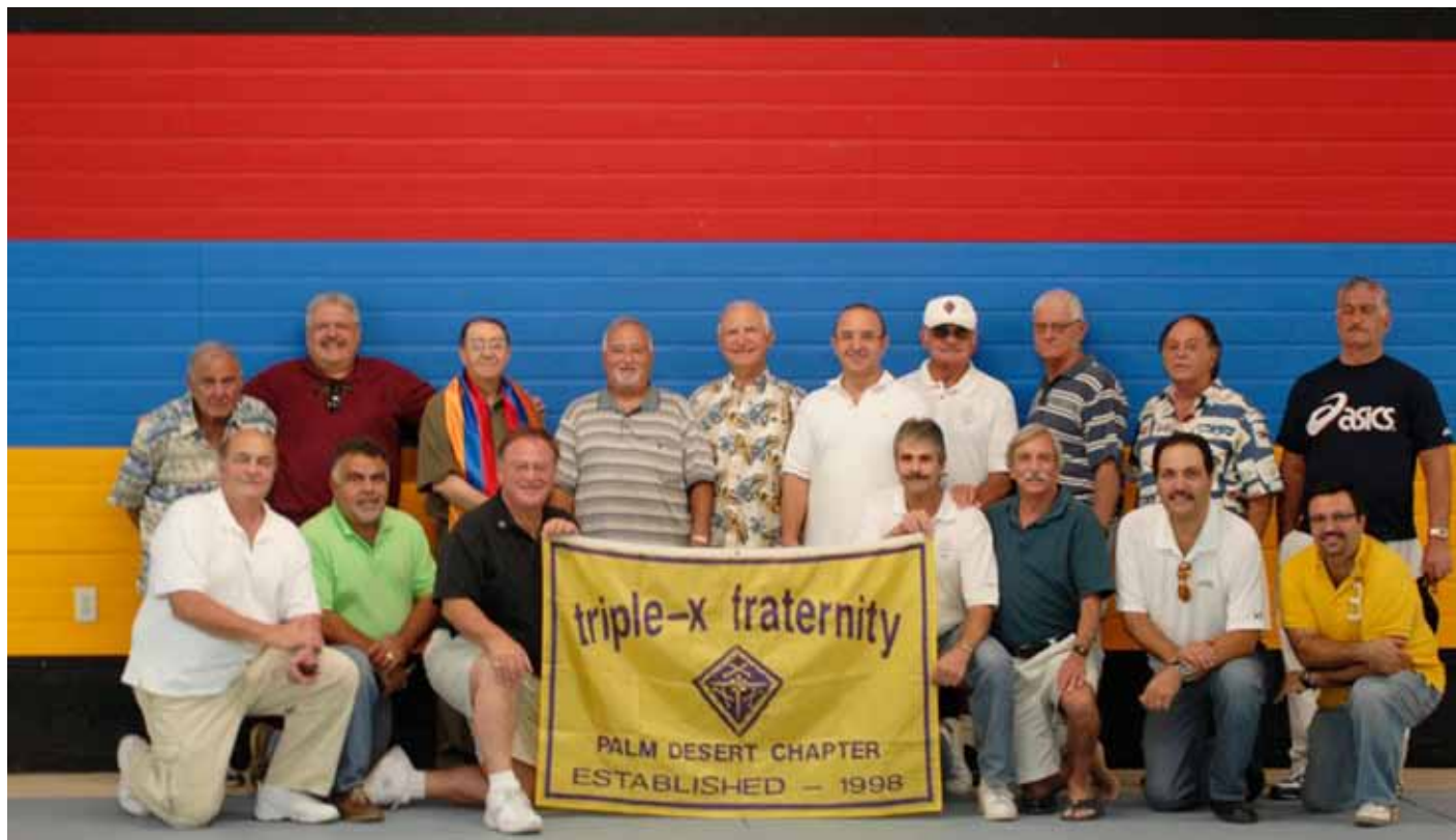
In front of the largest Armenian Flag in the World

Our annual Christmas Kef was held on December 10, 2011, at the Agua Caliente Casino ballroom.