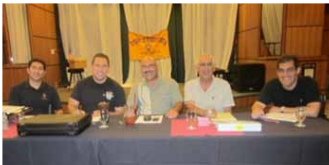
Past Officers of Selma Chapter at a Business Meeting inside Club One Casino – Fresno.

Soon afterwards, brothers and their families attended the 2011 Las Vegas Convention hosted by the Las Vegas Chapter during Labor Day Weekend. All of us that attended truly had a wonderful experience throughout the entire weekend. Thank you to