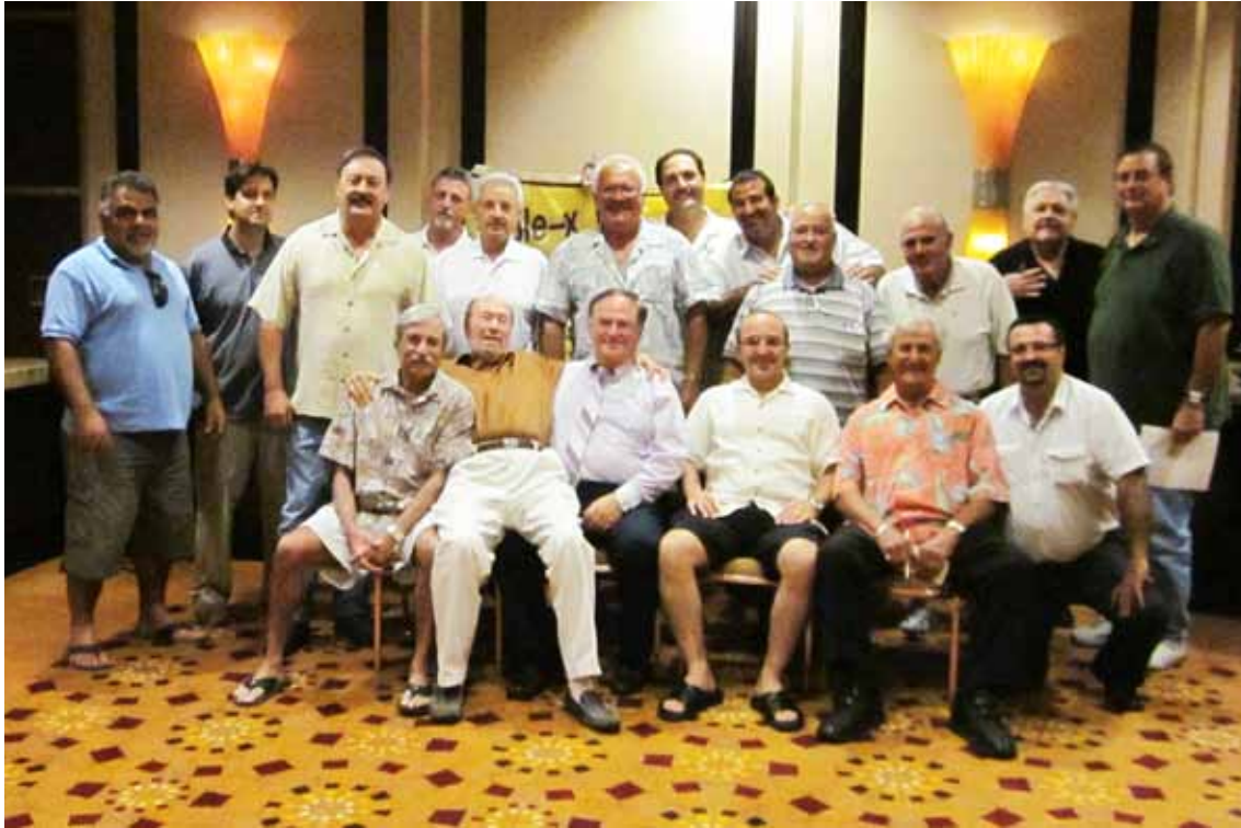
October 2011 Meeting