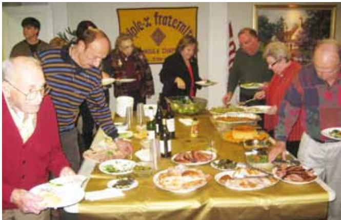
Members and guests alike gather around the table as they fill their plates with all sorts of amazing holiday treats. Everyone agreed that the dinner was excellent -- kudos to our great chefs and organizers!

great group effort; thanks to all! Funds raised during the weekend are put towards our charitable donations throughout the year. As always, all the hard work was worth it, as it turned out to be another huge success. A local cable show cameraman stopped by to film us as we prepared a (free!) kebab sandwich for him, and several of our customers even commented that we should have our own restaurant!