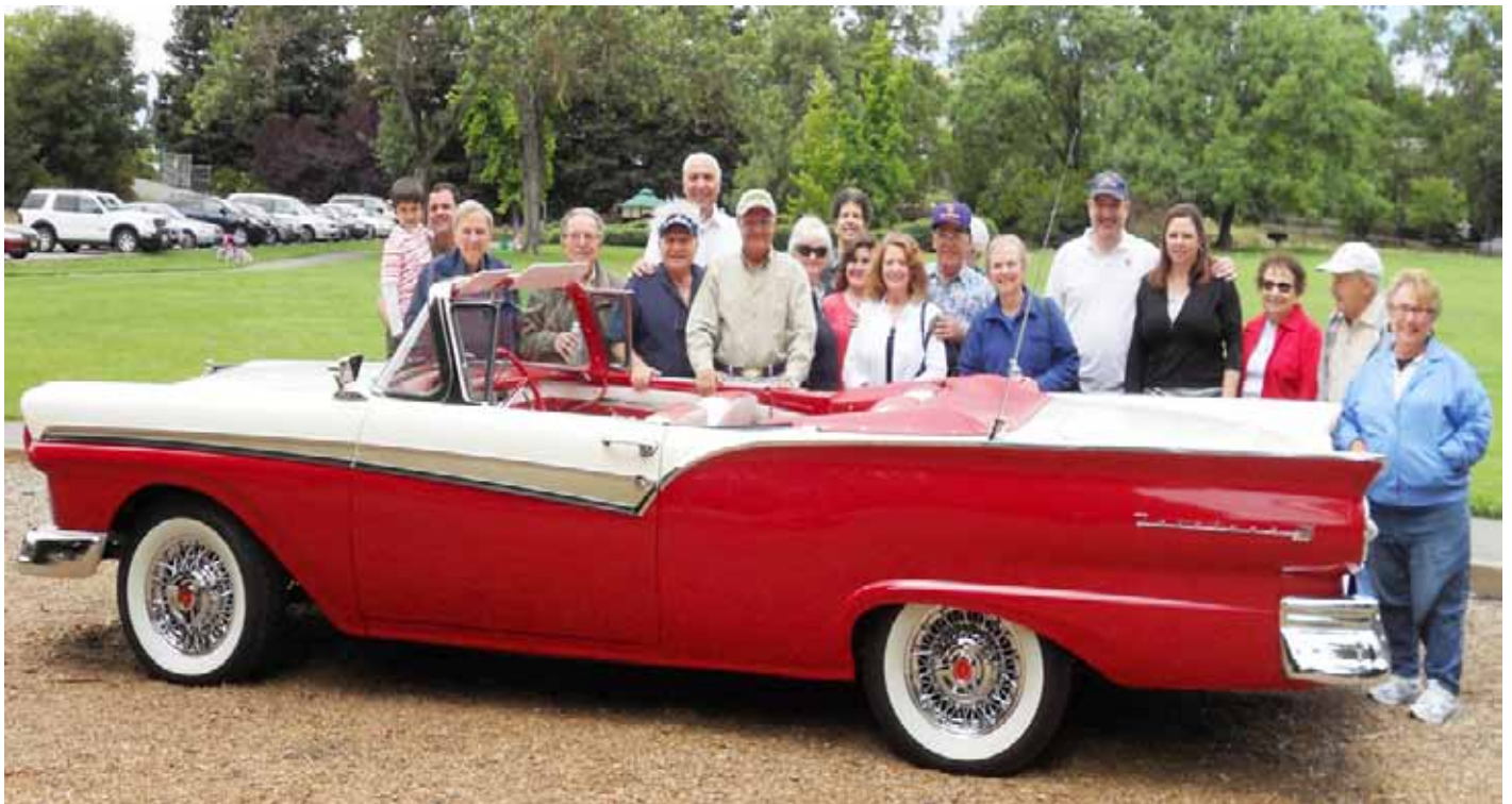
Mt Diablo Picnic