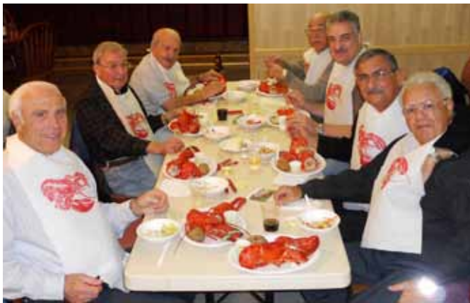
Mt Diablo enjoying Lobster at Oakland Meeting