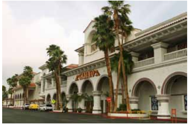
Gold Coast Casino