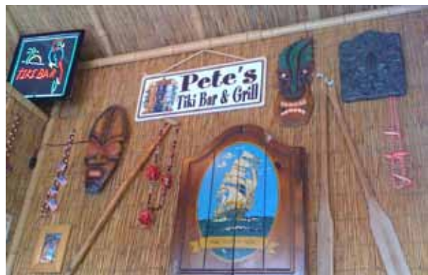
Pete's Tiki Bar & Grill