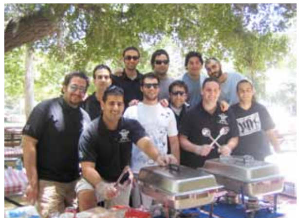
Brothers at the Trex Family Picnic in Glendale