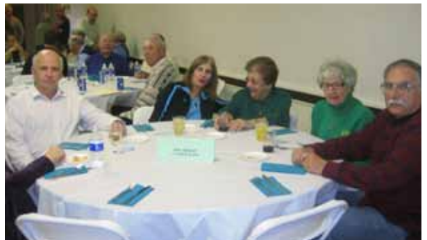
Law Enforcement Night