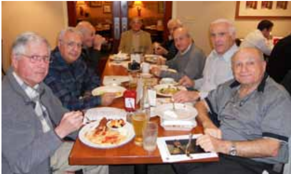
Mt Diablo Brothers enjoying dinner at a Trex Meeting