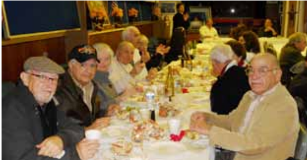
Mt Diablo Crab Feed