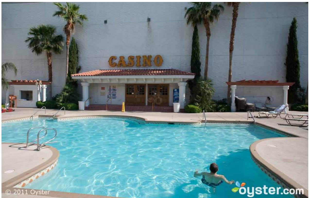
Gold Coast Swimming Pool