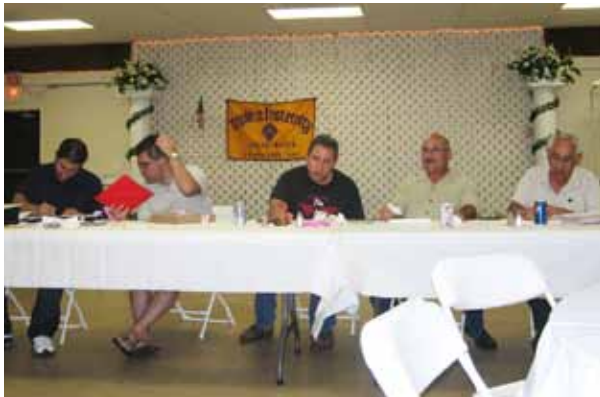
Selma Chapter Officers at a Bus. Meeting - Fresno Club House

Have to thank the Fresno Chapter Bros. for sharing the Club House with us for meetings and