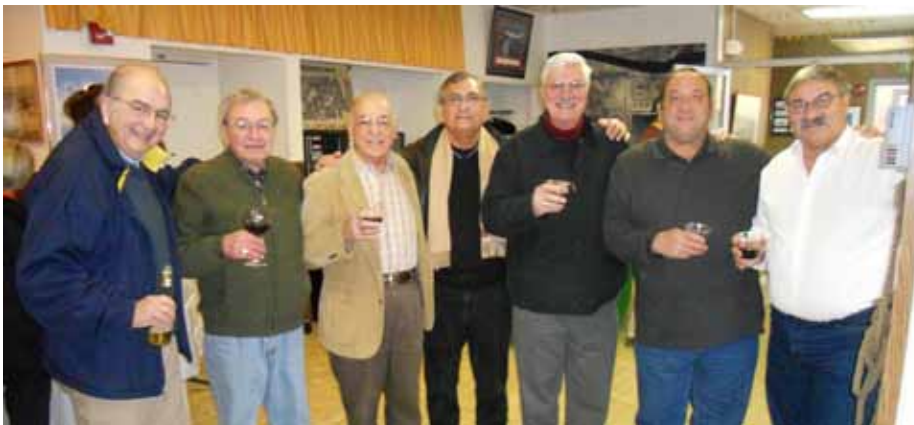
Brothers at Mt Diablo Crab Feed