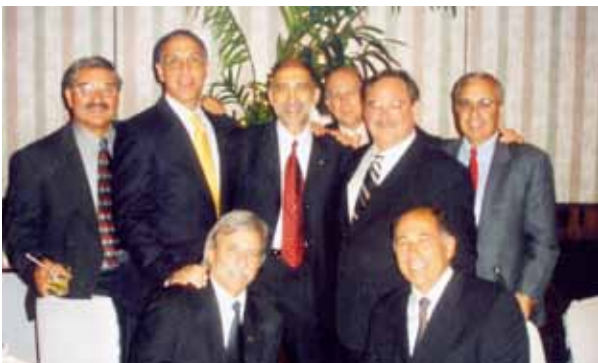
Triple X brothers find time for a picture at a wedding.