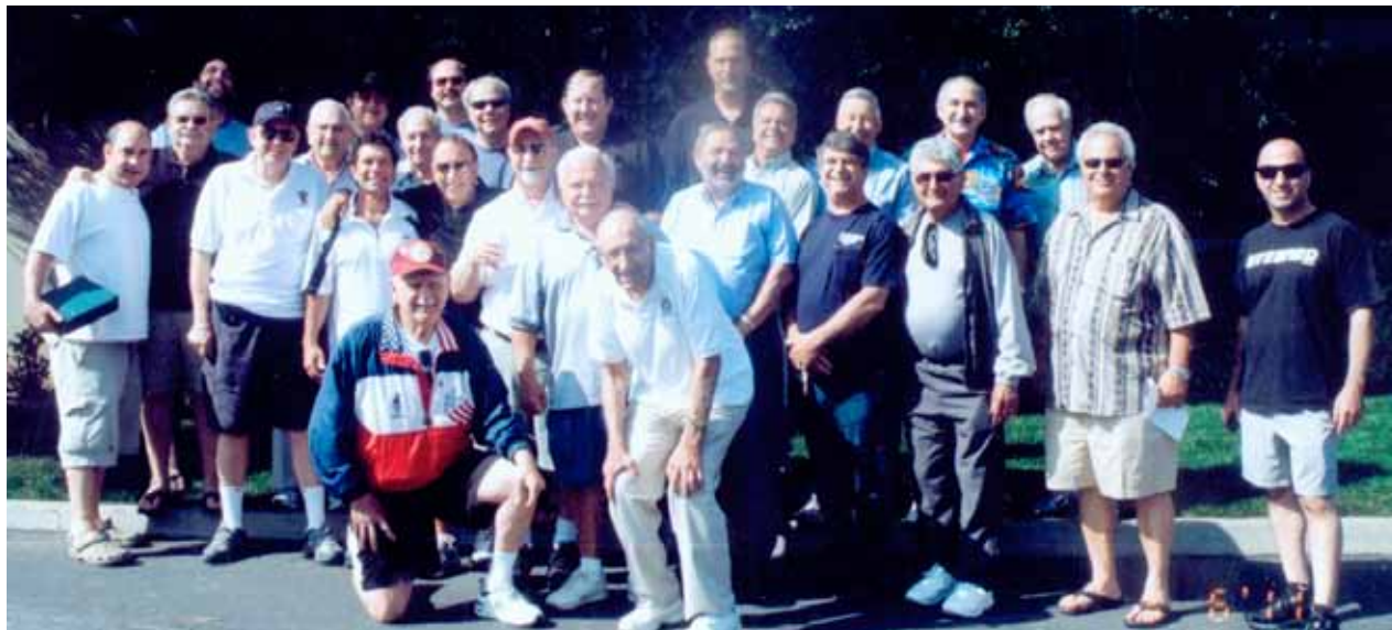
Laughlin Stag Outing