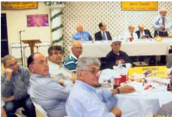
Mid Term in Fresno.