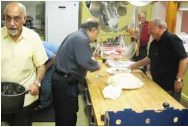
Peninsula members busily preparing yet another delicious dinner for our May monthly meeting.

the mezza and dinner, as well as catching up with our fellow Brothers from all of the other Chapters. Several of the Brothers tried their luck in a nearby Indian casino before the meeting, but alas, their dreams of untold riches went unfulfilled.