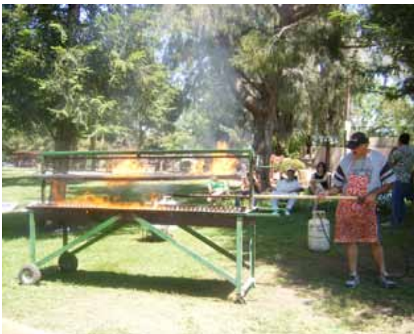
Sequoia Trex Picnic Barbecue