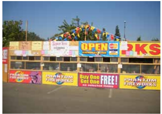
Fourth of July Booth