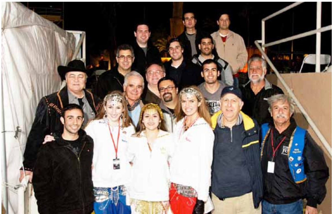
RIVERSIDE COUNTY FAIR & DATE FESTIVAL 2011. Palm Desert Chapter and visiting chapter members with Date Festival Queen's Court