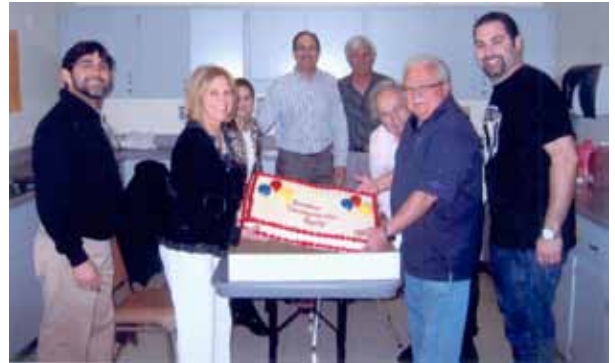
Fairview Developmental Party