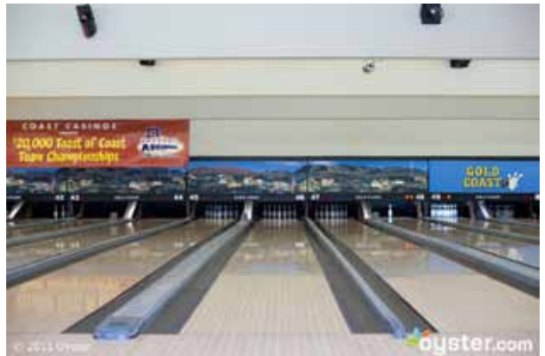
Gold Coast Amenities