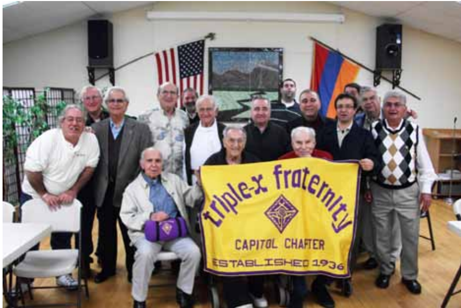
The Happy Clan of Capitol Chapter 2010 joined by Grand Chapter guests.