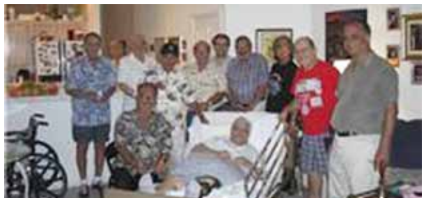
Brothers visit PGM Chuck in Hospital