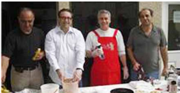
Servers at Ice Cream Party

Hope to see everybody at the next convention and we promise an exciting Labor Day weekend in Las Vegas, and Good Luck to all the poker players.