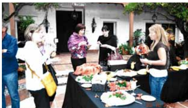
Guests enjoying wine, cheese, hummus spread.