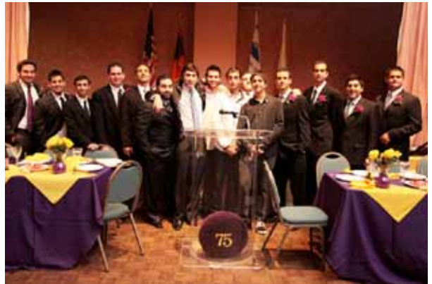
LA Jr. Brothers before the Ceremony