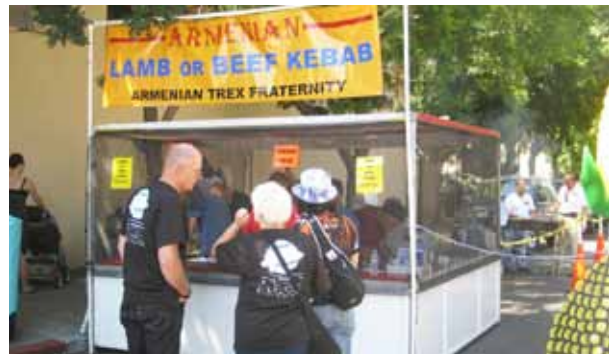
A crowd begins to gather around our food booth at the Mountain View Art & Wine Festival!