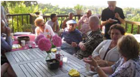
Everyone at the July BBQ had a great time eating and socializing!