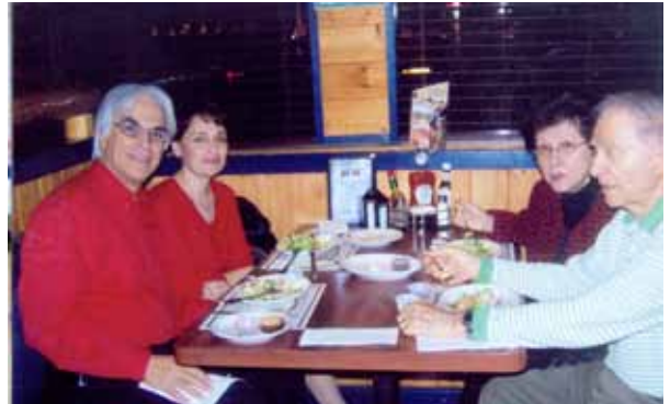
Brothers enjoying Christmas dinner at Yosemite Falls.