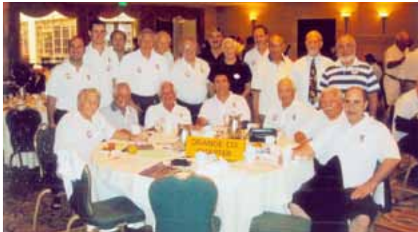
2010 Convention - Brothers Having Fun.