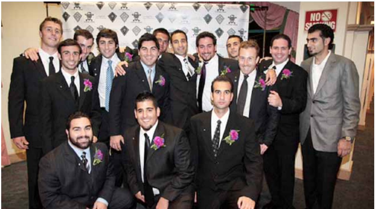
Jr. Brothers after the Anniversary.