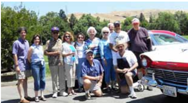
Mt Diablo Family Picnic.