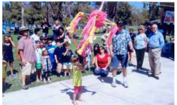
Kids having fun at picnic.