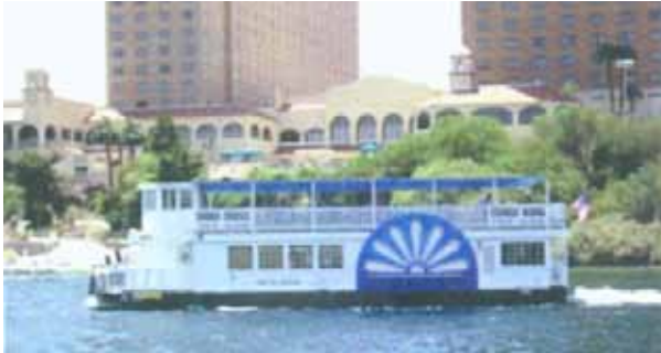
Laughlin Stag Outing. 46 Brothers on this boat.