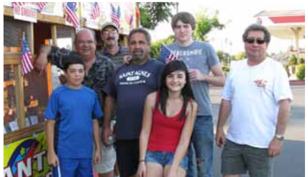
Sequoia Chapter's fireworks stand