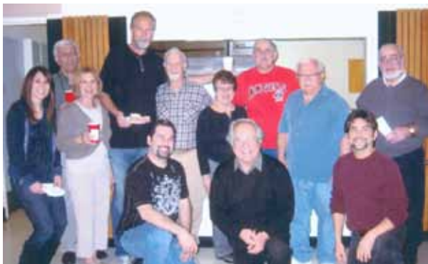
Brothers and wives helping at Fairview Development Party.