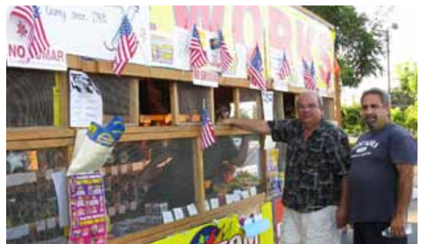
Sequoia Chapter's fireworks stand