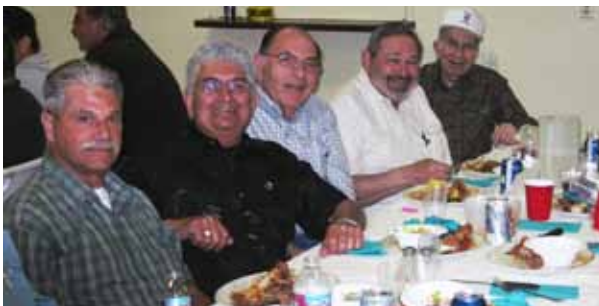
Fresno Chapter Bros. at our Law Enforcement Night at Fresno Club House.