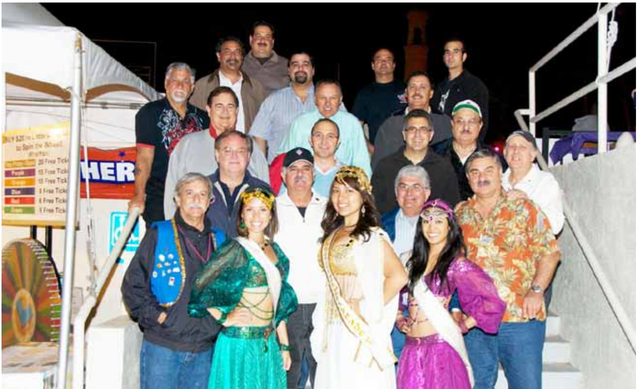
Trex Day at The Fair with Brothers from Palm Desert Chapter and other visiting chapters. The Queen of the Fair and her Court joined in the fun.