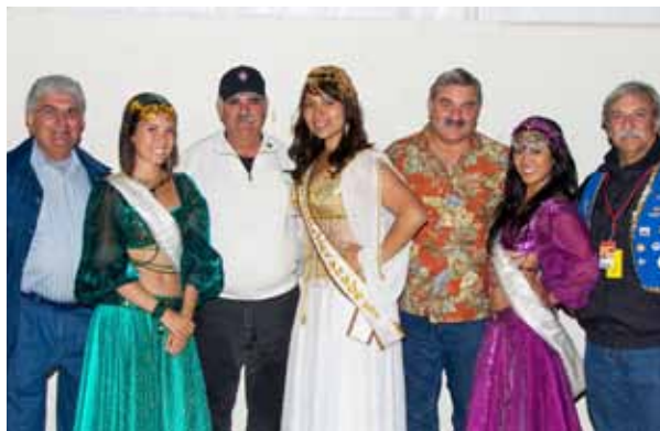
Day at the Fair with Current and Past Grand Masters and the Queen and her Court.