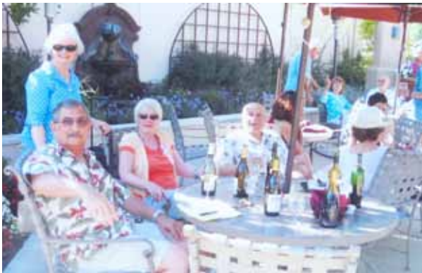
Mt Diablo Brothers and wives enjoying fine wines at Round Hill Country Club Patio Party.